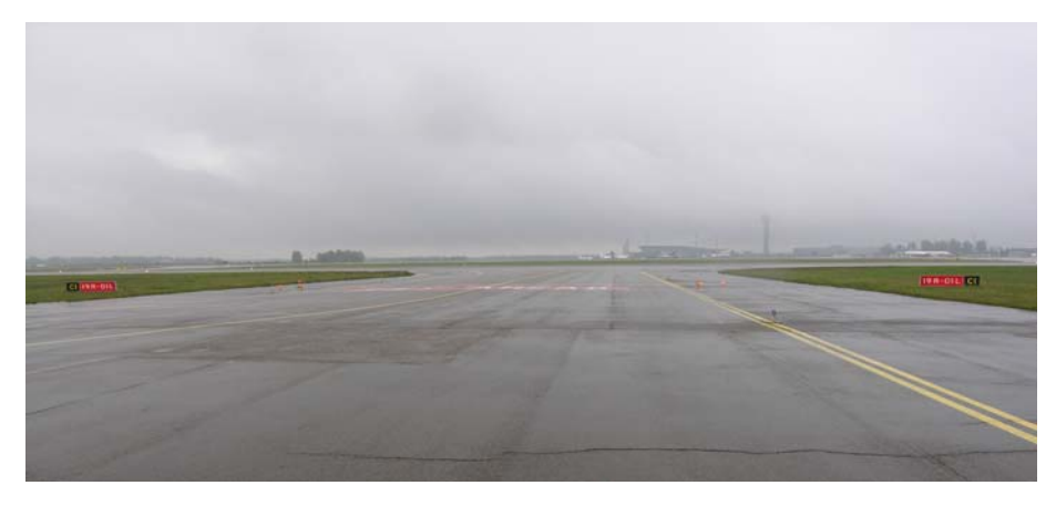
Figure 2: Holding position C1 as seen from the GA area.

Holding position C1 is clearly marked with stop bars and signs, as well as surface markings which include the words "RWY AHEAD" (see figure 2).