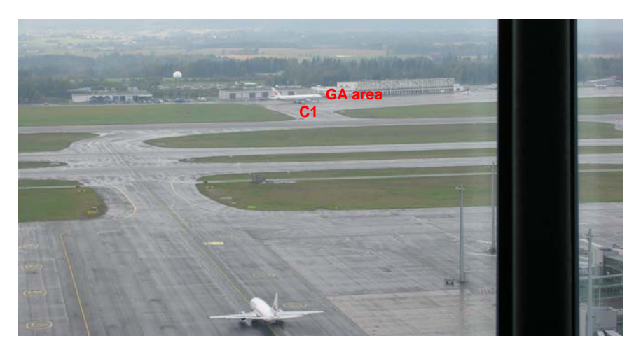
Figure 3: GA area and taxiway/holding position C1 as seen from working position TWR/W in the control tower.

Holding position C1 is clearly visible from the TWR/W working position (see figure 3).