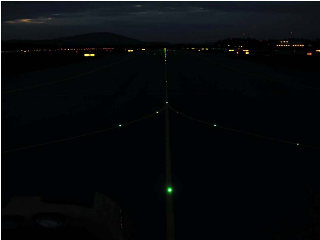
On TWY M at intersection TWY A3.