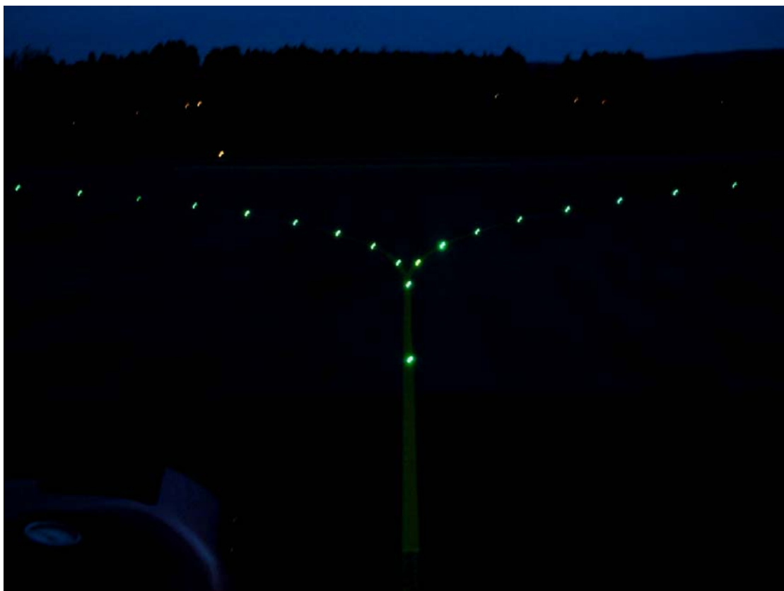
On TWY A3 at the holding point for RWY 01L.