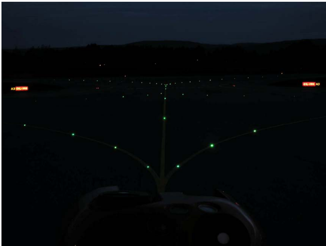
On TWY A3 at intersection TWY N.