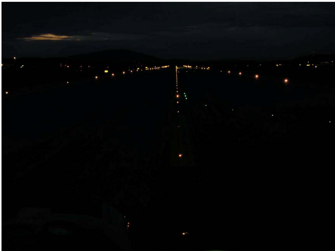
On RWY 01L at intersection TWY A3.